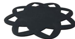
SurfaceGuard Item #SES651