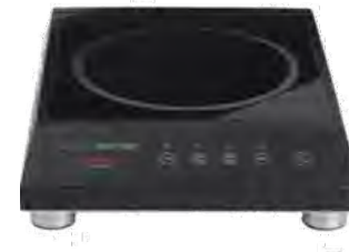
MAX Induction 650W