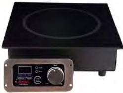
MAX Induction Drop-in 1800W / 2600W / 3500W