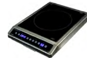
Adventys BRIC 2500W / 3000W / 3600W