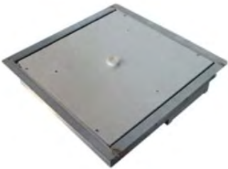
Adventys GEOLINE Undercounter 650W

Includes Induc'mate countertop protector - keeps countertop from scratching