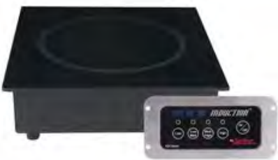
MAX Induction, MultiSurface 650W