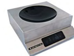
Adventys GEOLINE Wok 3500W