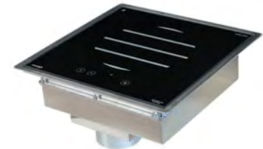
Adventys GEOLINE Induction, Exposed 650W