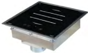
Adventys GL Cooker 1800W / 3000W