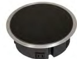
Induction DOT 300W