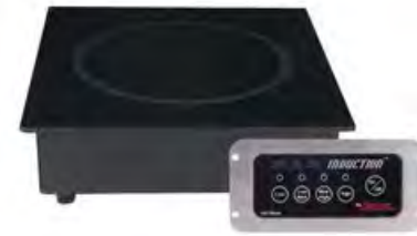
MAX Induction, Exposed 650W