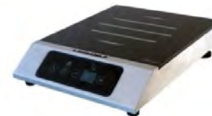
Adventys GEOLINE 1800W / 3000W