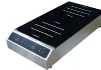
Adventys GEOLINE GL2 Siberian 3500W / 5000W / 6000W / 7000W