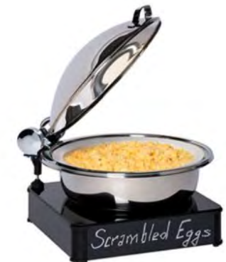
Adventys Elegance Induction 300W