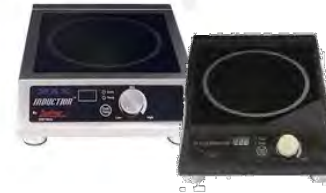
MAX Induction 1800W / 2600W / 3500W