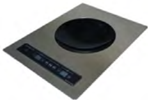
Adventys DWIC 3600 Wok 3600W