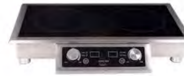
MAX Induction Double 5000W (2500 x2)