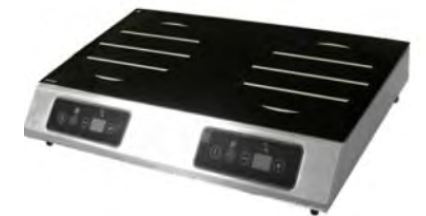
Adventys GEOLINE GL2 Persica 3500W / 5000W / 6000W / 7000W