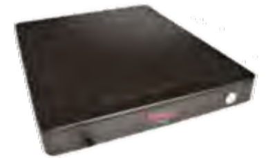
LoPRO Slimline Induction 300W