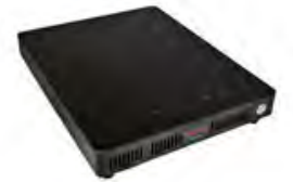
LoPRO Slimline Induction 1800W