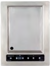
Adventys DGIC Griddle 3000W / 3600W