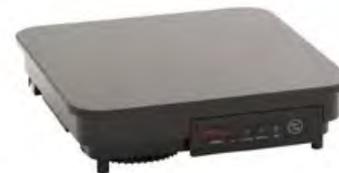
Unlimited Induction 300W