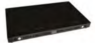
LoPRO Slimline Double 1800W (900W x2)