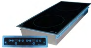
Adventys GL2 LYNX 3500W / 5000W / 6000W / 7000W