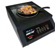
MAX Induction Sizzle 3500W