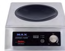
MAX Induction Wok 3500W