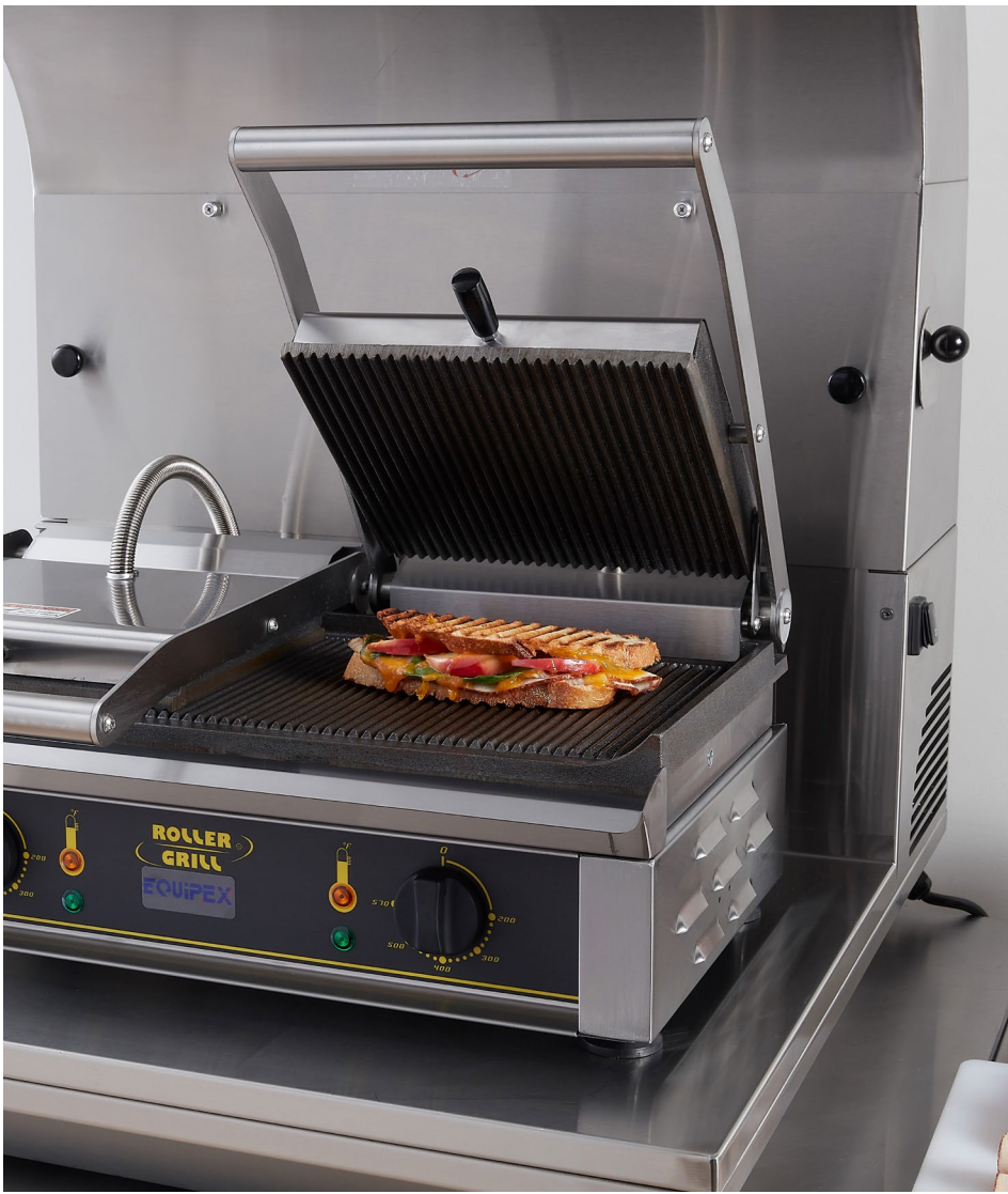
Roller Grill Panini Grill Equipex SA Ventless Hood Professional Nonstick Spatula 208/240V MAJESTIC 350W, 120V SAV-G Pali k2332