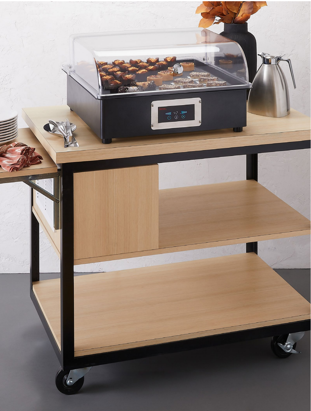
Countertop Cooling Unit Please Inquire

During the cool winter months is the perfect time to embrace the season's natural chill. Our frost top tables and countertop cooling units bring a refreshing touch to your buffet, echoing the crispness of the season.