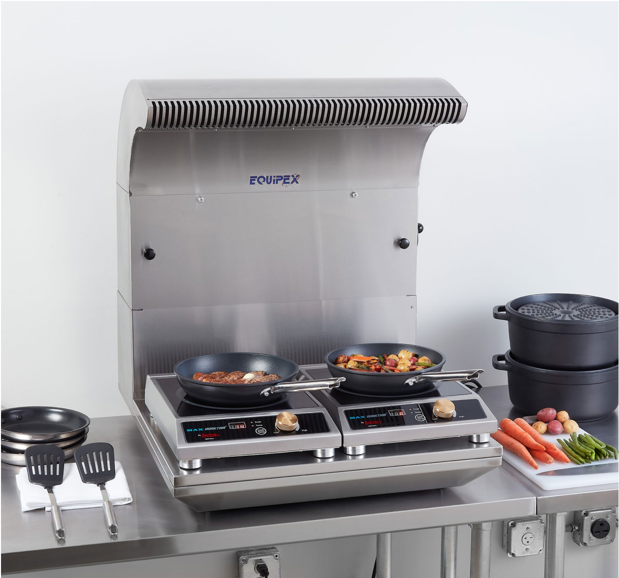
Professional Nonstick Spatula k2332