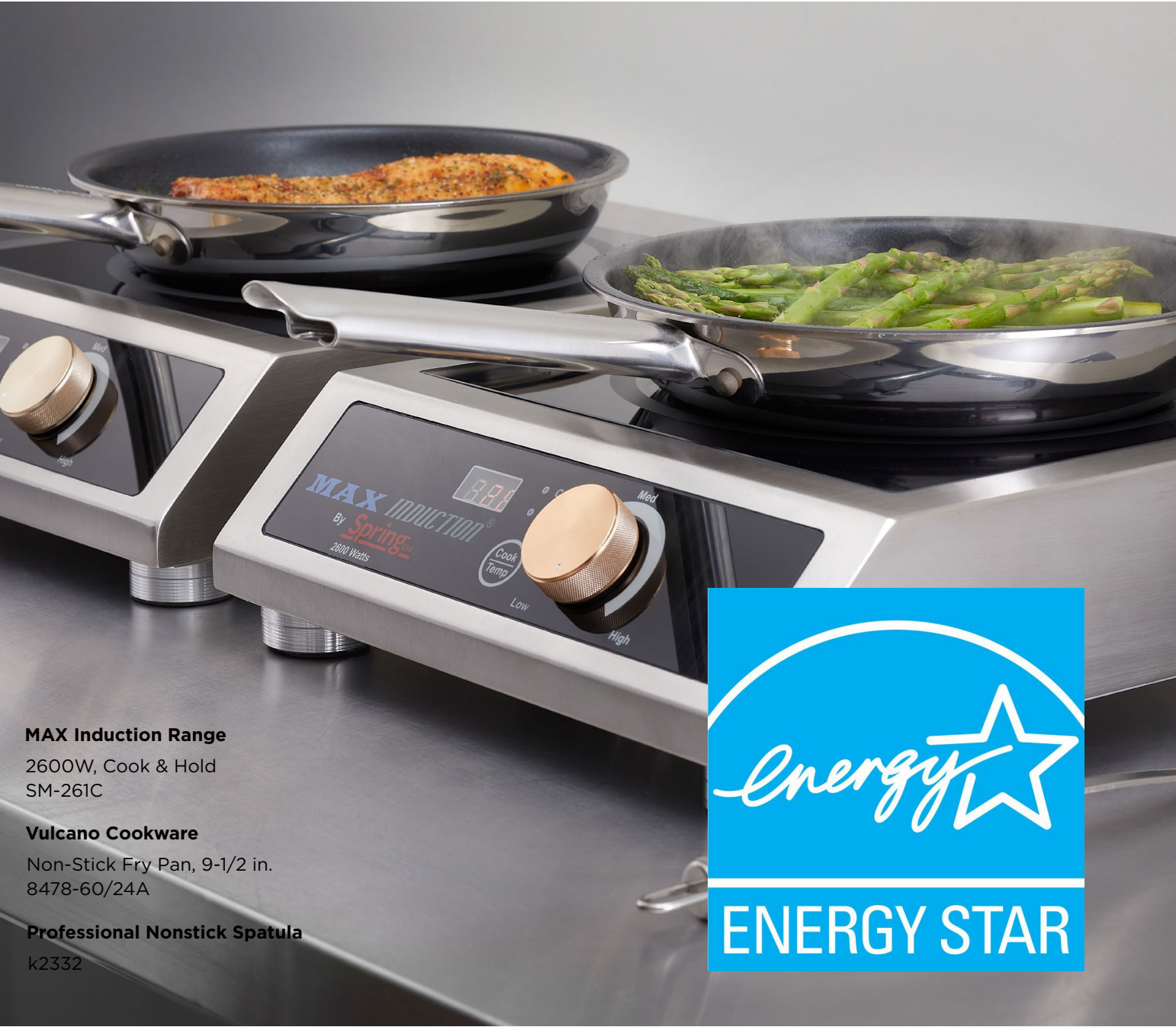
MAX Induction Range 2600W, Cook & Hold SM-261C