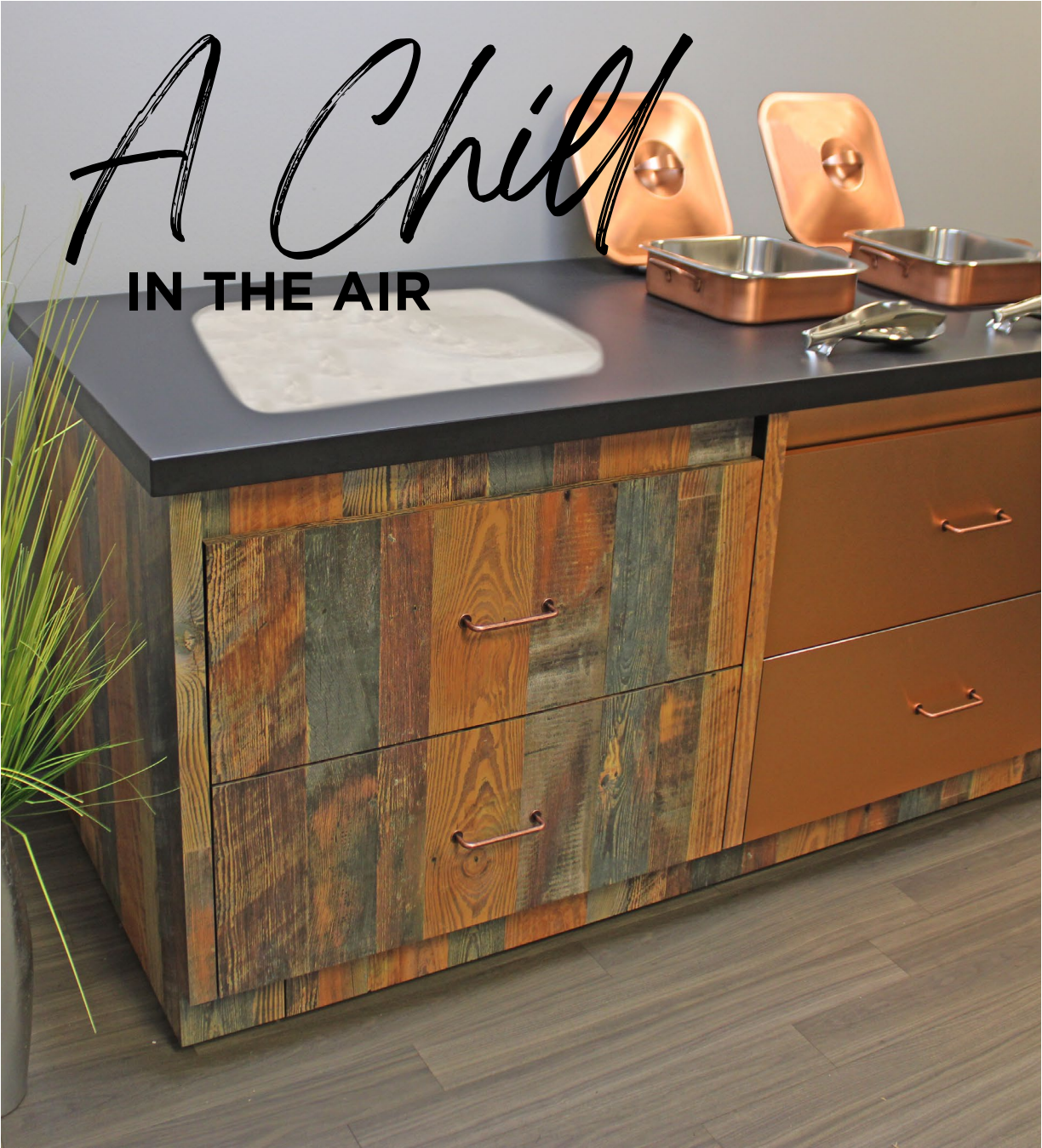
Gatsby Buffet Cabinet Hidden Induction & Frost Top CDC7332