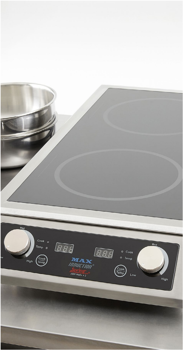
MAX Double Induction Range 5000W, Cook & Hold SM-251-2CR