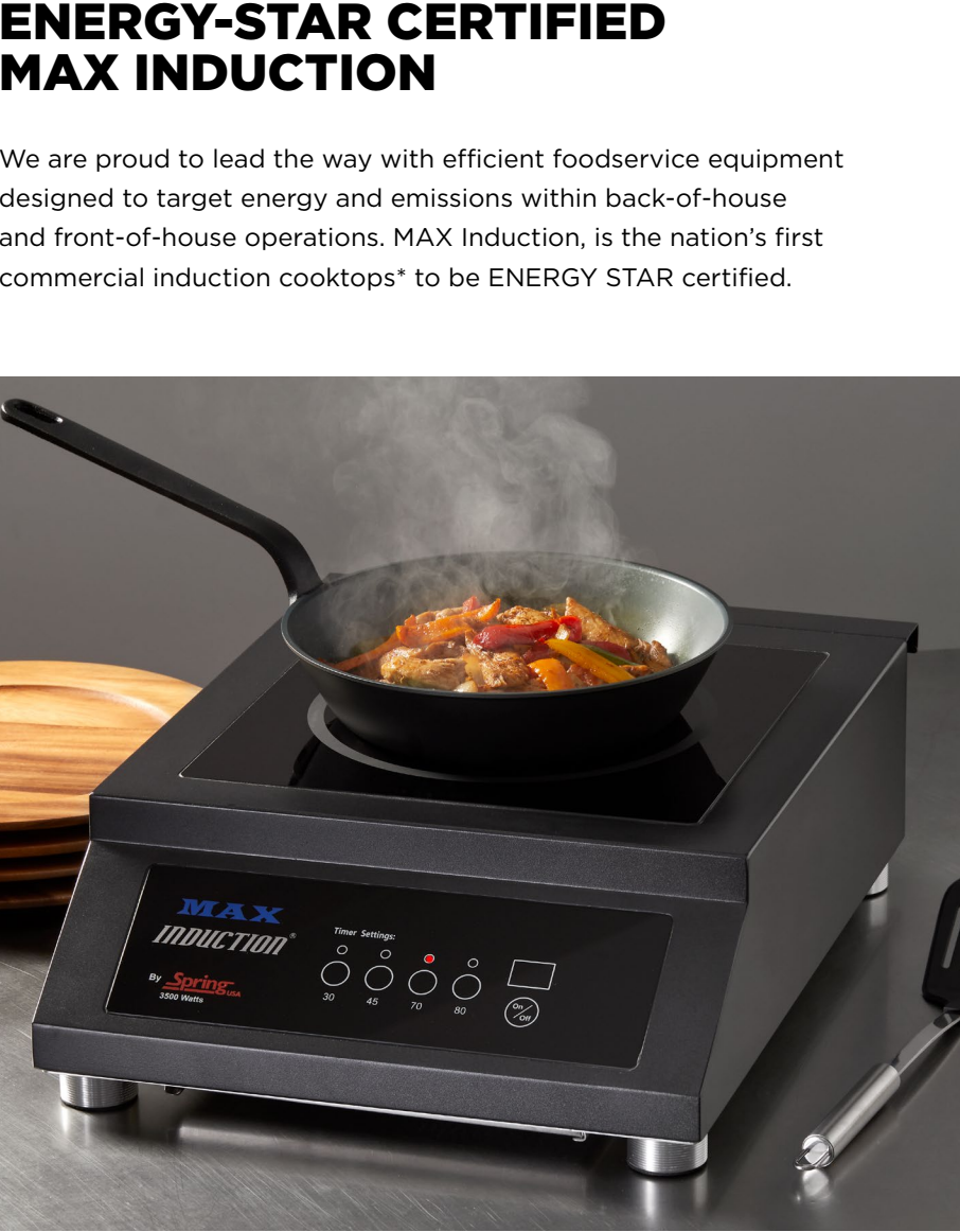
MAX Induction Sizzle Range 3500W, Cook & Hold SM-351C-FT