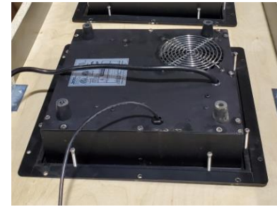
Figure 2. Induction Range & Mounting Bracket with Leveling Screws