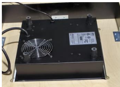
Figure 1. Induction Range Placed in Cutout